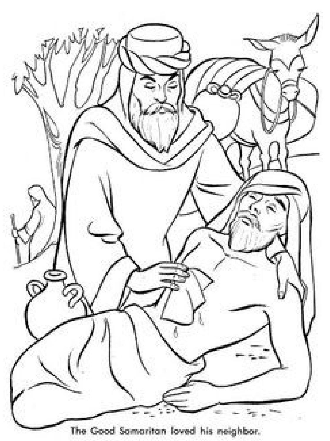
Page | 14