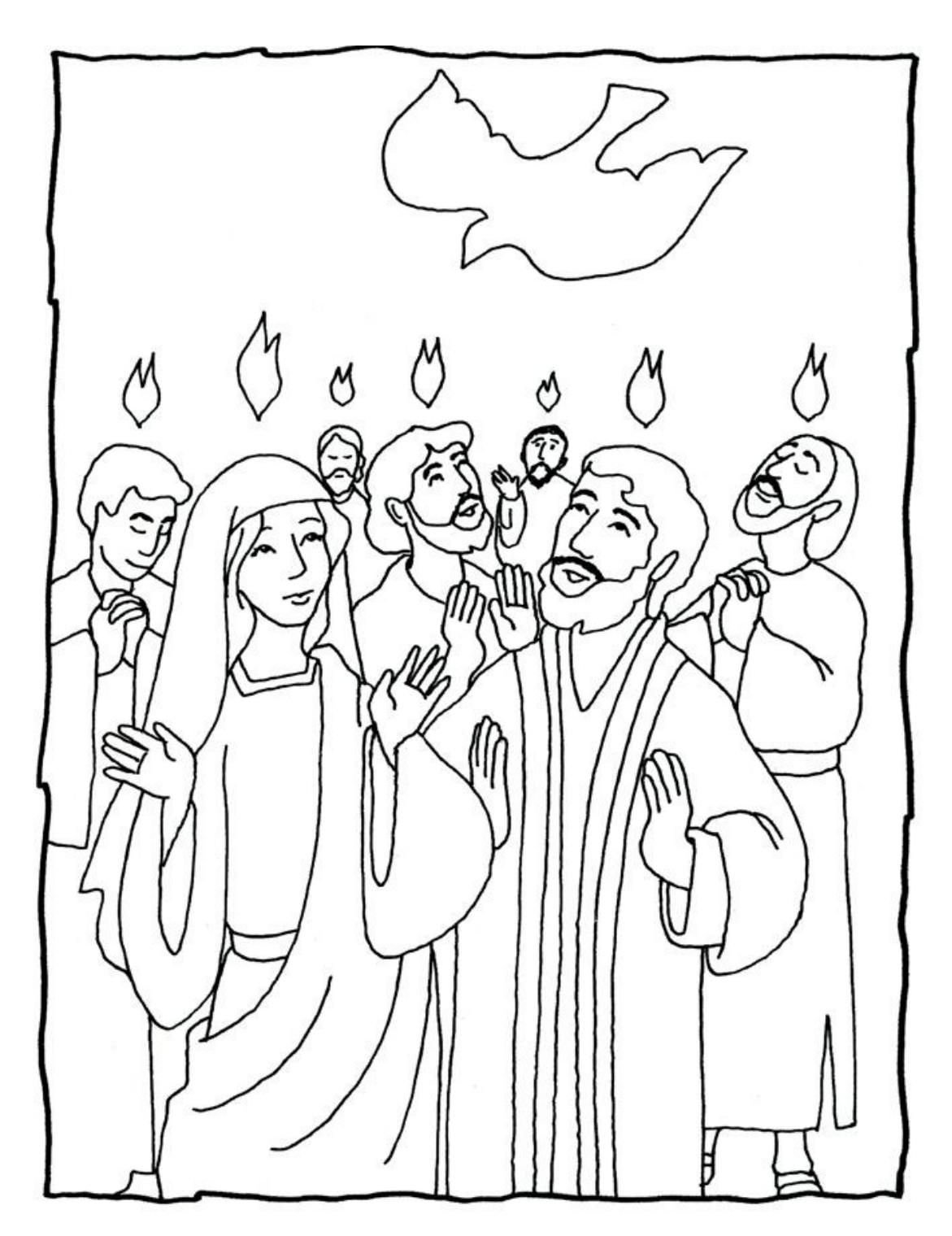
Page | 10