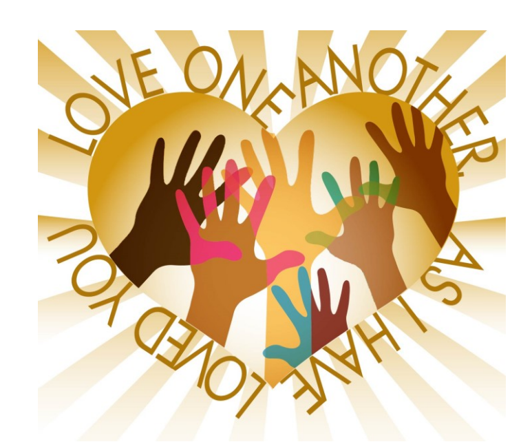
May 5, 2024