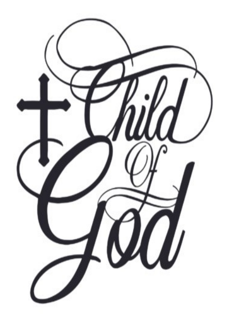
April 14, 2024