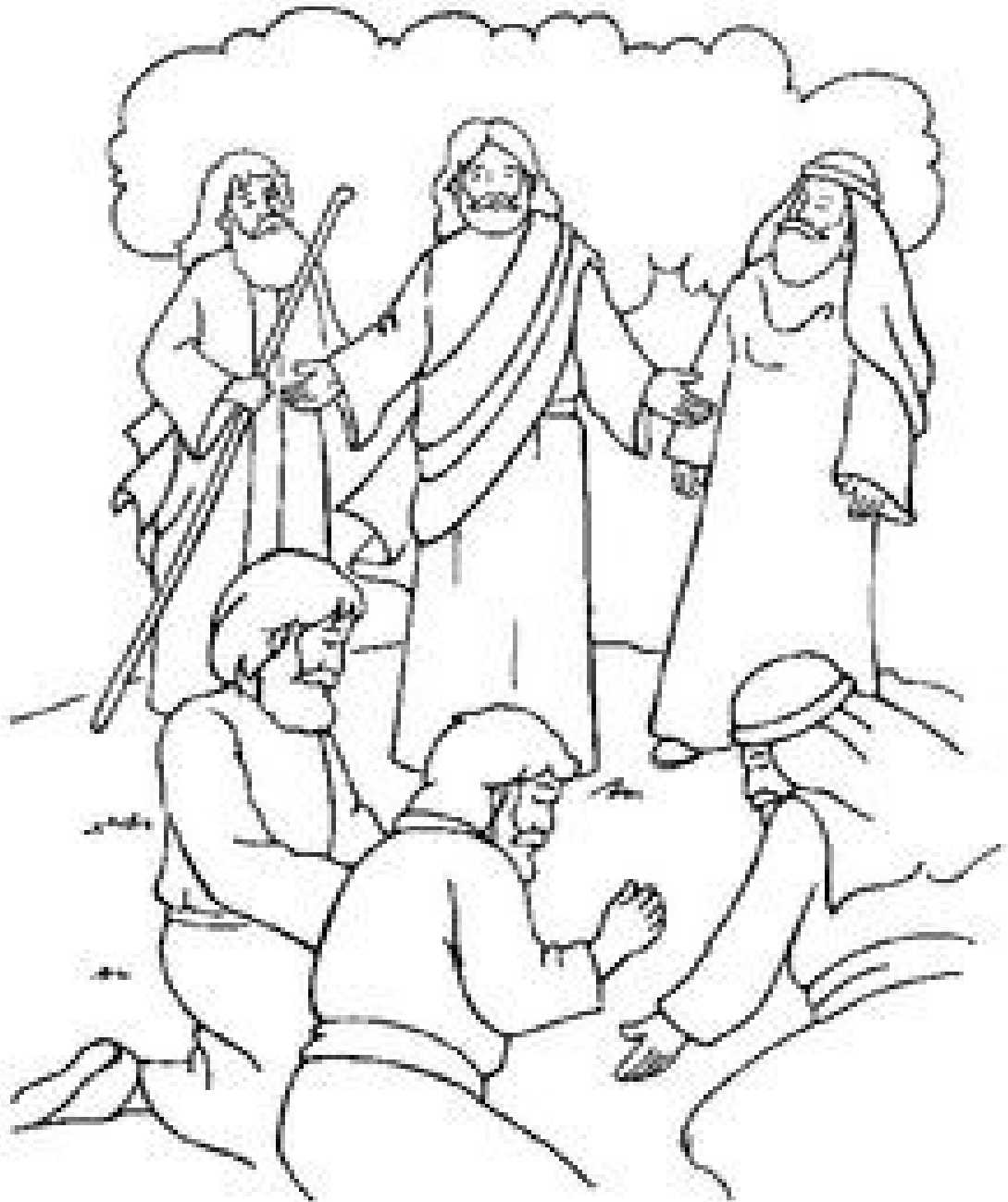
The Mount of Transfiguration Mark 9:2-9